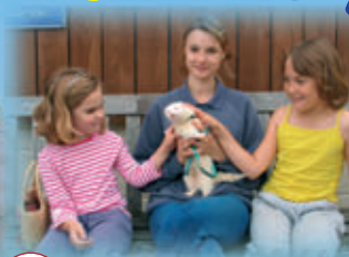
6 Presentations & Meet the Animals