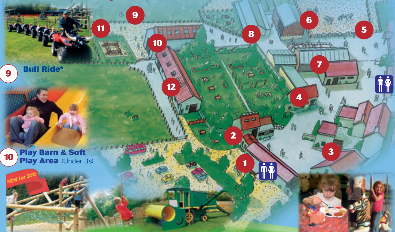
9 Bull Ride*