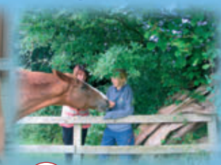
5 Nature Trail & Memorial Walk