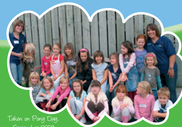
Taken on Pony Day, September 2009

Please call 01275 540 173 or visit www.horseworld.org.uk for details.