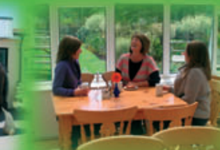
2 Stable Door Café with Award Winning Garden