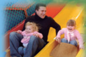
10 Play Barn & Soft Play Area (Under 3s)