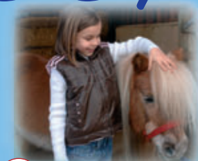
8 Touch & Groom

Information correct at time of going to print December 2009