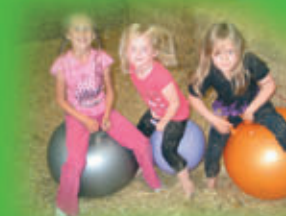
12 Straw Den