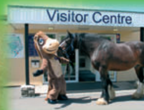
1 Main Entrance & Gift Shop