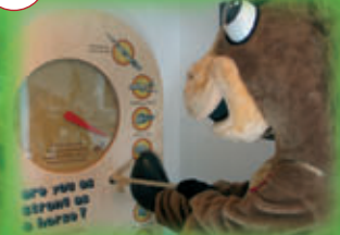
3 Museum & Interactive Centre