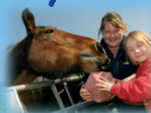
7 Interactive Feeding