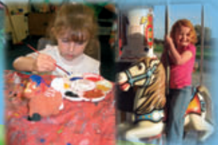
4 Creative Area & Carousel*