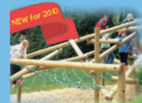
11 NEW - Play Area with Ariel Runway, Jungle Climber, Kidbine Harvester & More!